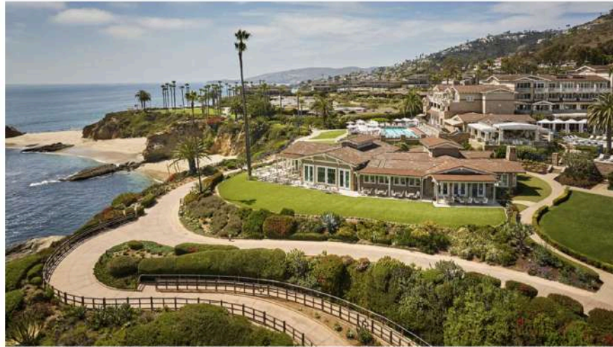
The new Studio Mediterranean restaurant at Montage Laguna Beach.

Thanks to new hotels and dining experiences, Laguna Beach has more to offer than ever. The oceanfront enclave is also an idyllic dupe for Hawaii and Cabo — minus the travel delays, headaches, and jetlag.